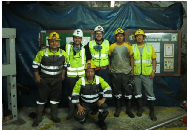
Figure 14. Hanging with some of the technicians at the Atlas Copco underground workshop.

rigs due to their positive environmental impacts.