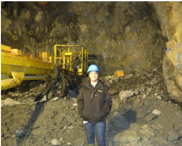
Figure 11. Probably the most metropolitan charged face in the world.

Following these inspiring meetings I was taken to the Nacka underground test mine which has been operating since 1938. This is most the most unusual mine and probably the most urban of any mine in the world located under Atlas Copco Head Office, a shopping centre and 10 minutes from Stockholm CBD, all at only 40m below ground level – now that’s confidence. It is also likely the only mine you will see several Audi’s driving around in. Here numerous products are tested and shown to prospective clients in operation. I was able to go see a charged face ready for blasting and see air leg drills in operation, destined for India and the African market. It was an eye opening experience to see this taking place in such an urban setting and also interesting to see the focus on the equipment with no interest in the mined product.