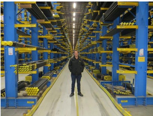
Figure 8. Standing amongst the 16km of storage shelves for the world supply of AC drill steels.

After lunch at another restaurant overlooking a medieval castle I was off the Distribution Centre, a huge logistical success that manages over 500t of product turnover weekly. I was also able to meet with an employee who had worked for Atlas Copco most of his life and discuss his career progression and gain an insight into what my future may hold; working and maybe raising a family overseas, learning new languages and changing roles. During this chat I heard about his many travels with work and after him naming a few countries I commented “So you’ve seen a lot of the world”, to which he replied “Oh, I’ve seen it a few times”.