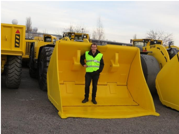
Figure 3. Hanging in the bucket of a 14 tonne Scooptram ready for shipment

mining is “If you want something stuffed, send it to Aus”.