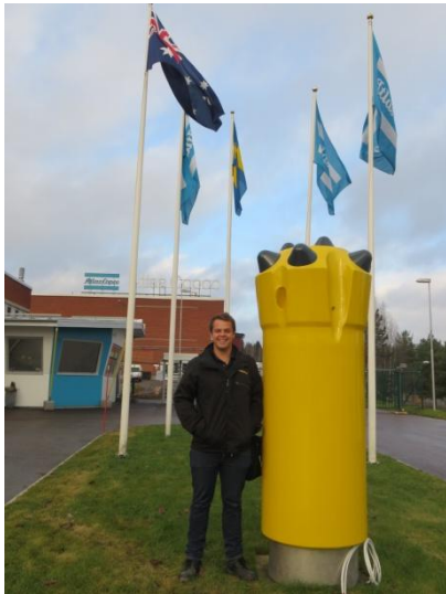
Figure 7. Having a “bit” of fun outside AC Secoroc with the Aussie Flag.

impregnated into drill tips to ensure longevity of the product.