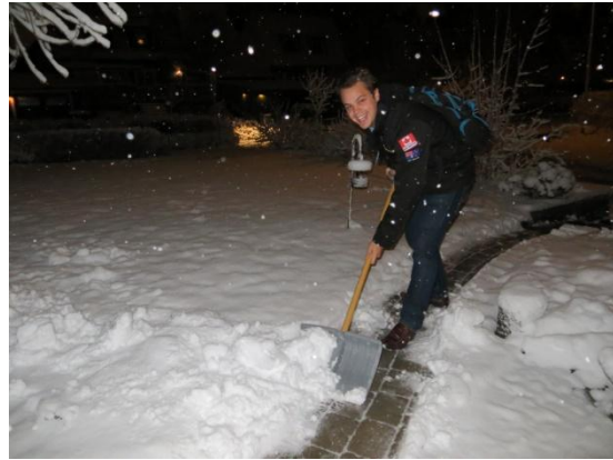
Figure 12. Shovelling the first fall of snow at the house of a Swedish couple that I met on my flight.

The next day I had a full tour of Stockholm with a tour guide and chauffeur. I was able to see the Vasa Museum, the old town, experience the first Stockholm snow while I ice skated in Kungsträdgården and then tried the local beers and schnapps – at pretty much Perth prices!