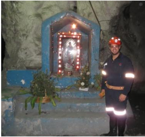
Figure 13. Having a photo next to one of nine religious shrines underground, a very a-typical mining experience