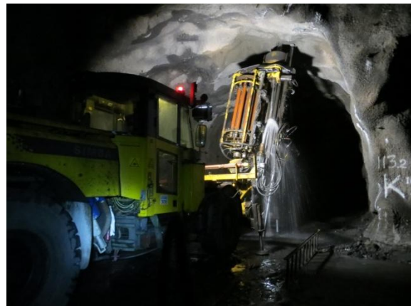
Figure 9. Automated drilling with an Atlas Copco Simba, with an empty cab as it is being remotely operated.

Currently LKAB have automated their LHDs, Primary crushing, secondary crushing, production drilling conveyors and winders. The mine itself has become a symbol of Swedish ingenuity and innovation. The mine employs 2300 people which means almost everyone in the town is either directly or indirectly employed by LKAB. The mine boasts over 400km of roadways and uses over 7% of Sweden’s entire cement requirements in the process of ensuring the annual production of 27Mt of high grade magnetite.