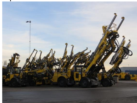
Figure 2. Drill rigs ready to be shipped off in the yard

In the URE division I was able to visit the most pristine and efficiently run workshops, constructing rigs to order by highly skilled operators with minimal inventory. In the workshop I was able to build on my experiences in Perth as numerous design components were pointed out to me as an innovation resulting from operations all around the world. This commitment to constant product improvement through liaison with customers is in my opinion a key to Atlas Copco's continual success.