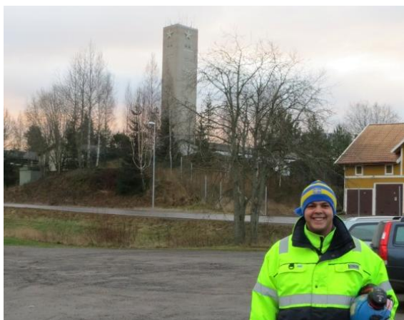
Figure 5. Standing outside on a chilly morning with the Zinkgruvan headframe in the background

While underground I was able to see several Atlas Copco products and even a Raiseborer in operation. I was also able to discuss with a mine worker and my Atlas Copco guide the Scaletec product used for scaling, an ongoing issue I had learnt about in Perth whereby Australian mines are using Boomers for scaling causing damage to machines as this task is out of their design function.