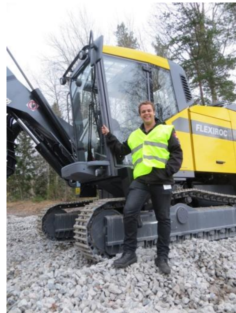
Figure 4. Standing next to one of the FlexiRoc rigs at SDE

Following my day in Orebro I was off to Karlskoga, to see the Alfred Nobel Museum, the famous inventor of dynamite which revolutionised mining the world over. It was an excellent opportunity to see a little more of Sweden and the best museum I have ever visited, I strongly recommend it for any travellers in the area.