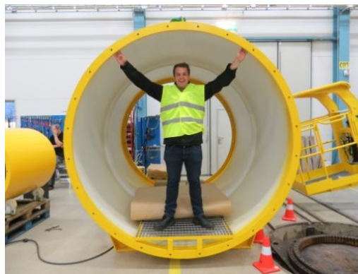
Figure 6. Standing inside one of the enormous ventilation silencers in the workshop

being able to run up to 11km without a booster. He was also extremely excited about the future developments into electric mining equipment and explained that the main customer of the ventilation projects was China who is investing a great deal of resources into developing underground storage facilities.