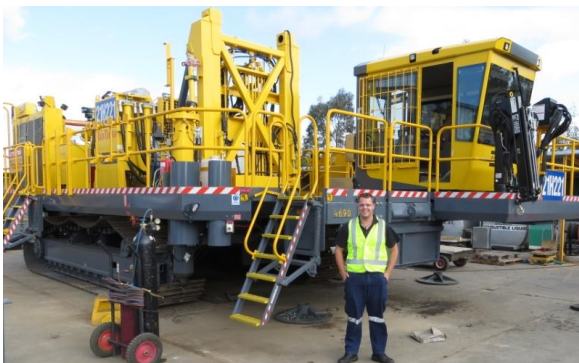
Figure 1. Standing in front of a Pit Viper undergoing final checks before transport to the Pilbara

I was also fortunate enough to have a training session in one of the amazing simulator facilities at the site used for training operators on the controls and software interface. Furthermore I was able to attend meetings and sit on the supplier side of the table, seeing how employees not only sold equipment but maintained their commitment to quality service, as one person told me, “sales sells the first rig, service sells the next 10” , timely advice for someone like myself just starting in the industry.